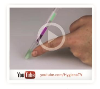
Watch an instructional demo at youtube.com/HygienaTV

PRO-Clean quickly and accurately monitors the cleanliness of surfaces to help ensure product quality by detecting protein residues left behind after cleaning. Simply swab a surface, release the reagent, and if protein residue is present the reagent will turn purple. The more contamination present, the quicker and darker the color change to purple. PRO-Clean quickly validates the hygiene of a surface, allowing immediate corrective action to be taken if necessary.